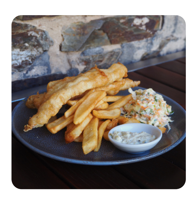
GF - can be Gluten Free V- can be Vegetarian VG -can be Vegan Please advise staff of any dietary requirements